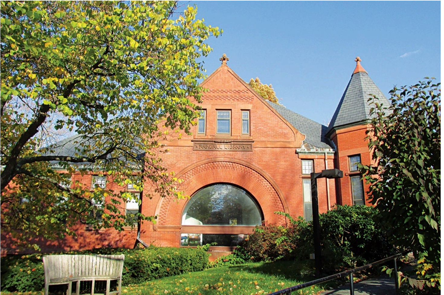
Stow is more than an apple-picking destination.